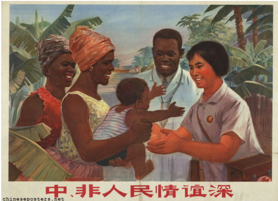
China-Africa Cooperation poster from 1972

throughout the U.S., Chairman Mao Tse-tung issued a message on April 16, 1968 entitled « Statement by Comrade Mao Tse-tung, Chairman of the Central Committee of the The Communist Party of China, in Support of the Afro-American Struggle Against Violent Repression. The statement read in part that « The storm of Afro-American struggle taking place within the United States is a striking manifestation of the comprehensive political and economic crisis now gripping U.S. imperialism. It is dealing a telling blow to U.S. imperialism, which is beset with difficulties at home and abroad. » (Chairman Mao, 1968)